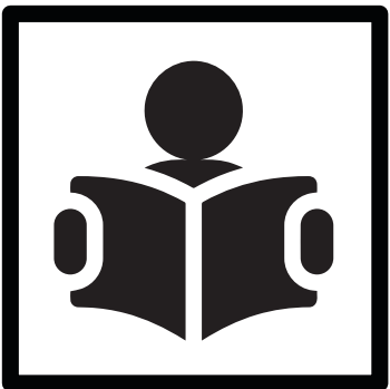
People who can't read