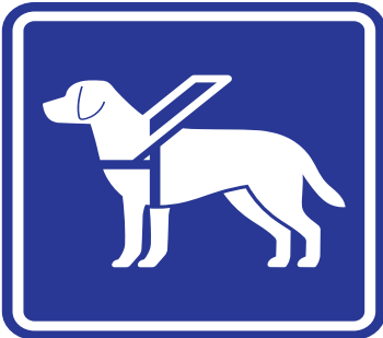
Blind or partially sighted people