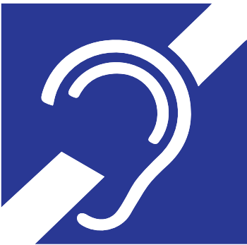
Deaf or partially hearing people